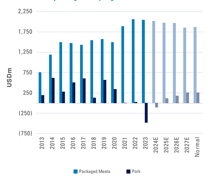
Exhibit 1: WHG Operating Profit by Segment