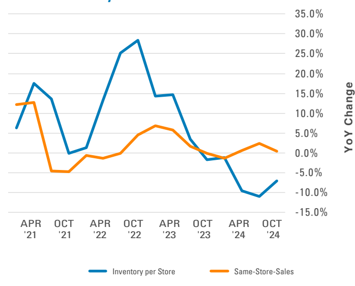
Exhibit 1: Inventory vs. Sales Growth